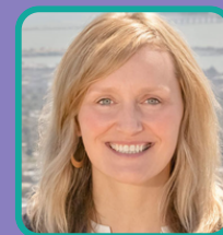
CA ASSEMBLY DISTRICT 14 BUFFY WICKS