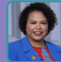
CA ASSEMBLY DISTRICT 18 MIA BONTA