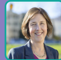
CA SENATE DISTRICT 9 NANCY SKINNER